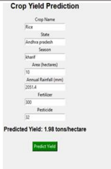
Fig 4 After entering the crop details, the system processes the input data using Random Forest, RNN, and FFNN algorithms to generate the predicted crop yield result