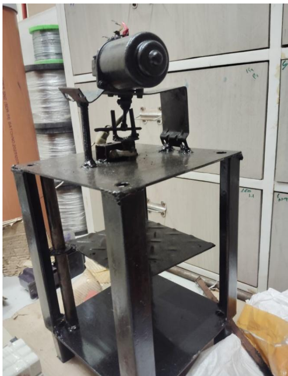
Figure 2: Fabricated Prototype – Experimental Setup

Energy Consumption Power per cycle: 20.4 W Energy per 10 s cycle: \approx 0.056\text{ Wh}