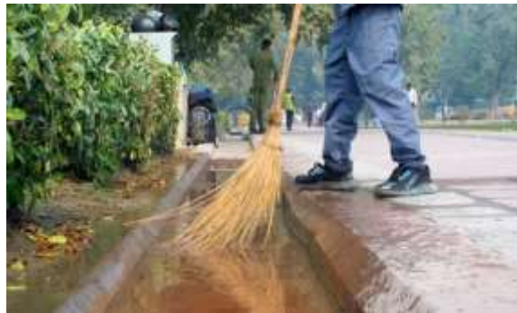
Fig: 1.1 Manual Sweeping

On the other hand, fully automated and vacuum-based sweeping machines offer high cleaning performance but involve high initial costs, complex maintenance, and the need for skilled operation, making them less suitable for small-scale or semi-urban applications.