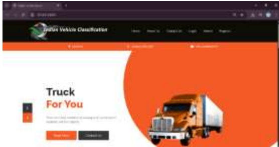
Fig 3: Home Page

Fig 2 shows that the project is developed using Python, TensorFlow, and Django. A virtual environment is used to manage dependencies.