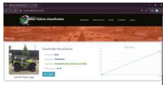
Fig 7: Mobile net Result

Fig 6 shows the classification result with the predicted vehicle type, model accuracy, and successful execution status. It also includes a performance graph for visualization efficiently to generate accurate results.