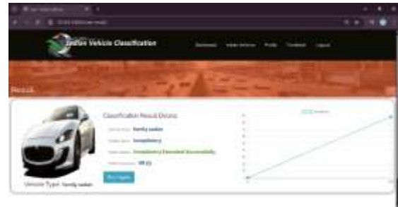
Fig 6: InceptionV3 Result

Figure 5 illustrates the vehicle classification interface with the InceptionV3 model selected. The user uploads an image and submits it for processing. The system analyses the input and predicts the vehicle category.