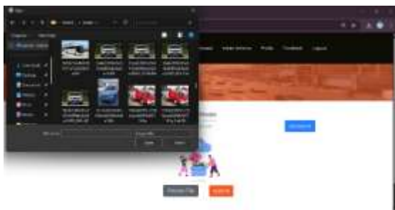
Fig 4: Loading Dataset

Fig 3 shows the home page with a simple and user-friendly interface. It includes navigation options like Home, About Us, Contact Us, Login, Admin, and Register. Users can easily access different features of the system through these options.