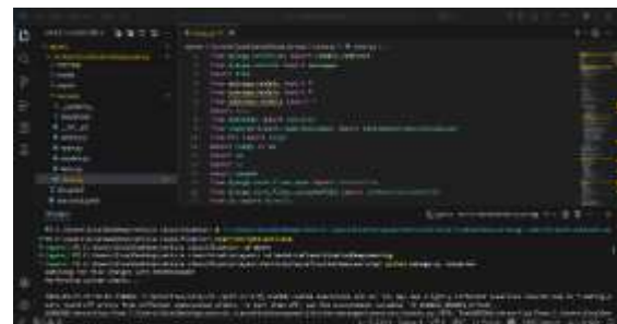
Fig 2: Python Environment

The proposed CNN model was tested on 1,503 vehicle images across seven classes and showed strong overall classification performance. It achieved stable training convergence with decreasing loss and effective feature learning from both low- and high-level patterns. While highly distinct classes like planes, ships, and trains were classified well, some confusion occurred between similar categories such as bikes and motorcycles.