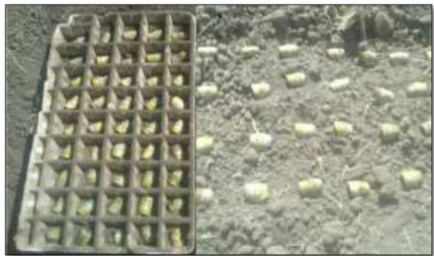
Bud-chip Sowing Technique

sugarcane growing areas after harvesting of wheat, higher yield can be obtained by planting sugarcane by poly bag method. Because a month before wheat harvesting, its nursery is prepared and planted in the main field. For preparing nursery in poly bag, first the soil mixture is prepared by taking equal quantity of soil sand and cow dung manure/compost and mix it well, after that 10 ml of Chlorpyrifos 20 EC mix one quintal of soil. This treated soil mixture is filled in a polythene bag of size 5 inches long and 5 inches wide. Some holes are made in the polythene bag all around and at the bottom, so that the excess water after irrigation will drain out and thus the setts of sugarcane will be saved from rotting. To