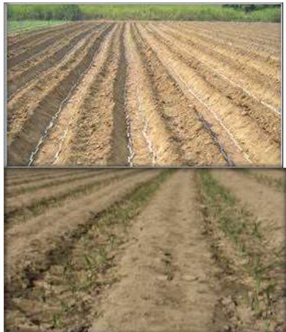
Sugarcane planting by paired row