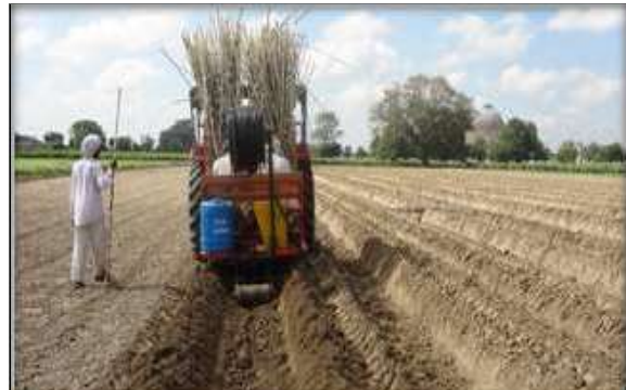
Sugarcane planting by mechanized trench method

In this method, one or one and a half month before planting, about 25 cm deep trenches are made for winter sugarcane at an interval of 90 cm and for spring sugarcane at 75 cm interval. Cow dung or pressed manure of sugar mill is applied @ 5-10 tonne per hectare in this prepared trench. The soil is prepared well by pouring irrigation and hoeing. After the sugarcane germination, along with the gradual growth of the crop, the soil of the ridges is dropped on the roots of the plants in the trench, which eventually forms a ridge in place of the trench and a trench in place of the ridge, which along with the irrigation trench, gets water during the rainy season. Also performs the function of drainage. This method is suitable for loamy land with high compost level and abundant input availability. This method not only gives a higher yield, but at