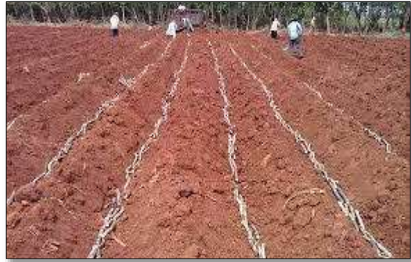
Ridge and furrow method of sugarcane planting

The distance between the top of the ridge and the furrow's bottom is kept at 20 to 25 cm. A few days prior to planting, the ridges and furrows are constructed. A few days prior to planting, the ridges and furrows are constructed. To create a healthy seed bed, the bottoms of the furrows are loosened to a depth of around 10 cm. Channels for drainage and irrigation should be properly supplied. At a distance of 20 to 25 metres from the furrows, irrigation channels are installed (Lal and Singh, 2007). In order to lift irrigation, the distance might be lowered. If the field is level and not graded in one direction, an irrigation channel can be used to water the furrows on each side. In these situations, the irrigation water is diverted to irrigate the furrows on either side, and a small bund across the furrow is required to check flow at regular intervals. In heavily watered areas, drainage systems are crucial.