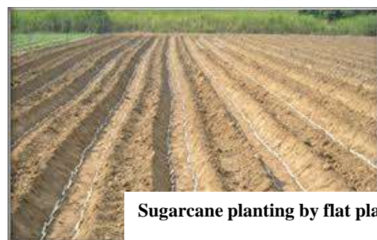
Sugarcane planting by flat planting method

The subtropical belt of India predominantly uses the flat planting method. According to