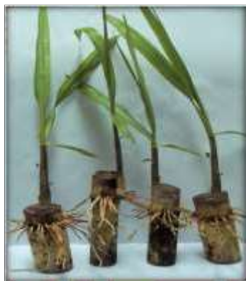
Sugarcane planting by spaced transplanting

In conventional planting of sugarcane using three bud setts, genetic potential for tillering is not fully exploited. Inter-plant competition and unevenly distributed solar radiation tend to affect tillering. Occurrence of higher mortality, adversely affected stalk density and crop productivity, per se . In addition, transportation of bulk seed material and slow multiplication rate (ratio being 1:8 to 1:10) are important constraints for the seed multiplication programme. Based on the sound physiological understanding of germination (sprouting), tillering vis-a-vis inter and intra-plant competition, a scientific crop management procedure, the Spaced Transplanting Technique (STP) has been developed for synchronization of tillering and quick seed multiplication of sugarcane. This technique ensures higher stalk population (number of millable canes) with a uniform crop stand and higher average cane weight. In this