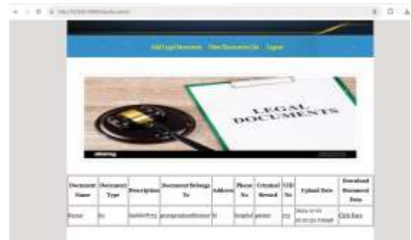
Fig 5. View Documents List