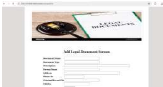
Fig 3. Add Legal Document Screen

Fig 3, titled Legal Document Addition with Security, likely depicts the result or a specific aspect of the AddDocumentAction view after processing a document addition. This figure emphasizes the secure storage of documents on the blockchain, as handled by the AddDocumentAction function. After the admin submits the form from AddDocument.html, the view saves the uploaded file, appends the document details to document_list, and executes a blockchain transaction using the smart contract's saveDocument function. The transaction receipt is captured, and AddDocument.html is re-rendered with a context containing the transaction details, which are likely displayed as a confirmation message or dialog.