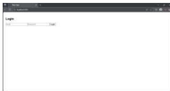
Fig. 2: Login

The experimental evaluation of the Women Safety Dashboards in Smart Cities demonstrated the system’s effectiveness in real-time monitoring, incident detection, and response coordination. By integrating IoT sensors, GPS data, and analytics, the dashboard provided timely alerts and visual insights on safety hotspots. The results showed improved accuracy in identifying high-risk zones and faster emergency response times compared to traditional systems. Overall, the analysis confirmed that the dashboard enhances situational awareness and supports data-driven decision-making for improving women’s safety in urban environments.