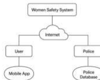
Fig. 1: System Overview

The proposed methodology of the Women Safety Dashboard in Smart Cities integrates IoT devices, real-time data analytics, and GIS-based visualization to ensure proactive monitoring and rapid emergency response. Data from smart sensors and mobile safety applications are collected and processed through a centralized system that analyzes incident trends and identifies unsafe zones using AI and predictive analytics. The dashboard provides dynamic visual insights for authorities to make informed decisions, deploy resources efficiently, and enhance public safety measures while enabling citizens to report incidents instantly through mobile interfaces.