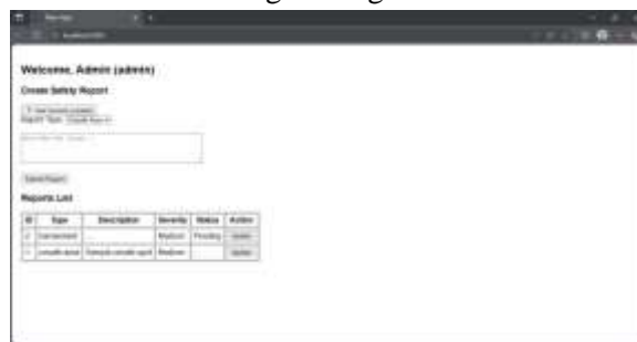
Fig. 3: Admin Dashboard