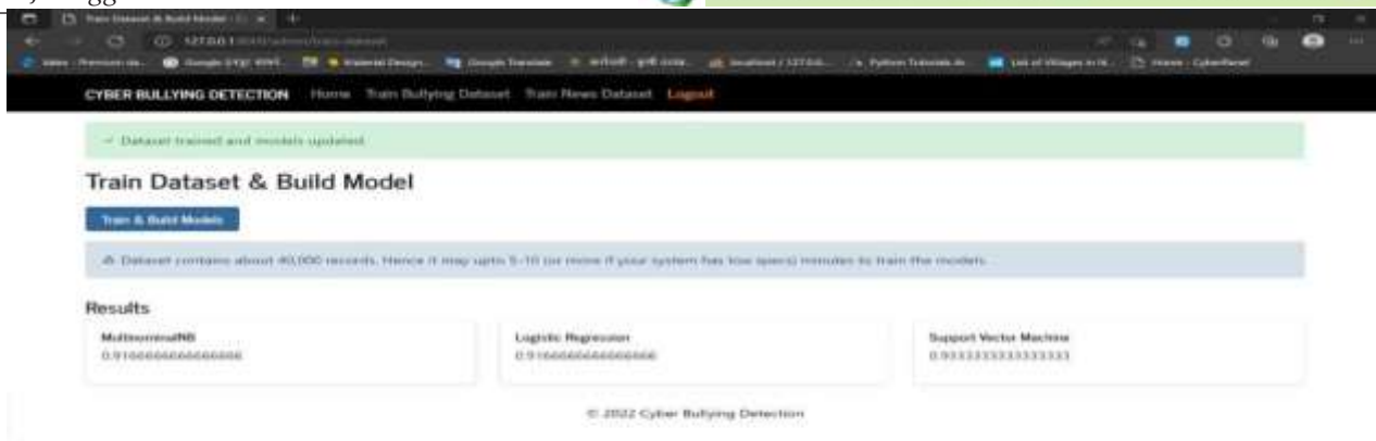
Fig 6: Results of Model