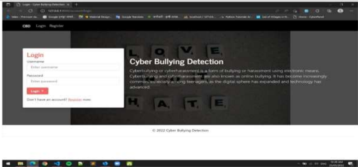
Fig 4: Login Page