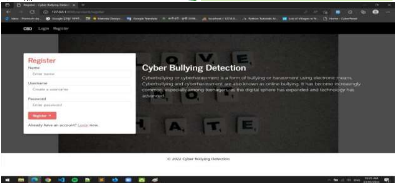
Fig 3: Page of Registration for Cyberbullying Detection