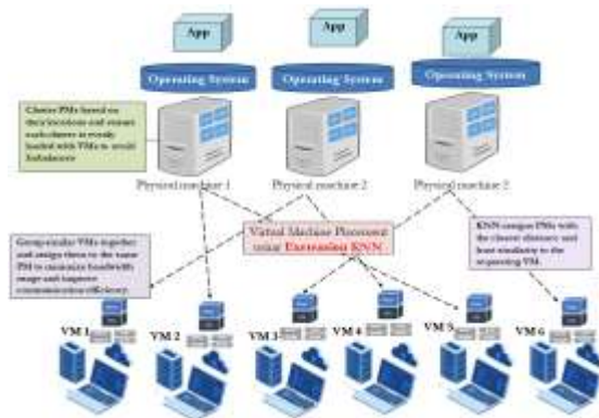
“Fig.1 Proposed Architecture”

The system is evaluated on the cloud AWS using EC2, Amazon VPC and Elastic Block Store (EBS) to replicate and evaluate the location of VM inside the realistic environment. The research confirmed the efficiency of the heuristic models of the location of VM and dynamic algorithms of clumping workload in AWS settings to reduce costs and increase performance [1], [20].