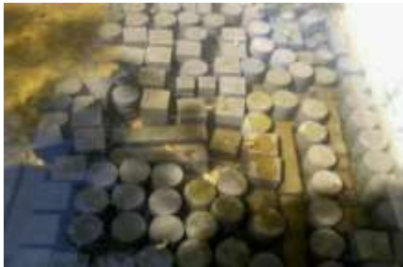
Fig. 1: Water curing of samples.